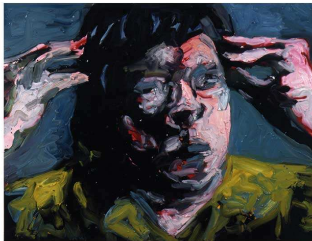
Paolo Maggis, 2005, In my mind Tecnica mista su tela, cm 147 x 193